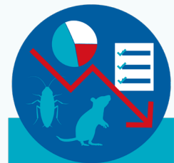
Independent Pest Consultancy