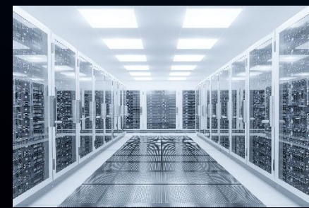
ICT Service Providers