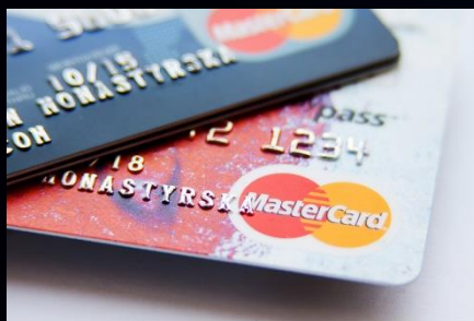
Companies of Critical Security Category