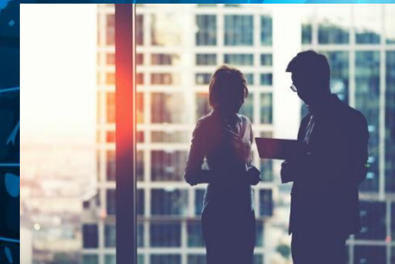
ICT Consulting and Services